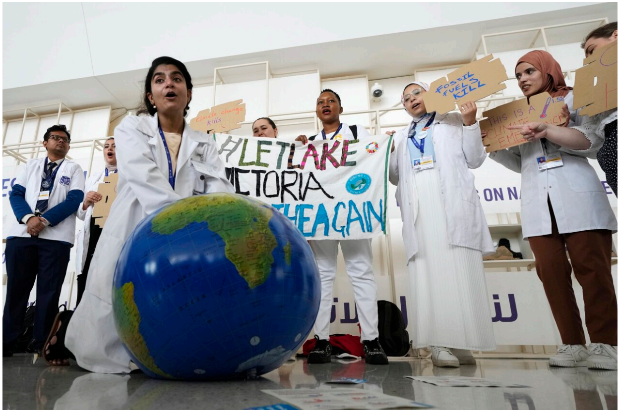
A woman pretends to resuscitate the Earth during a demonstration at the COP28 U.N. Climate Summit, Sunday, Dec. 3, 2023, in Dubai, United Arab Emirates.

Saturday capped off with conference organizers announcing that 50 oil and gas companies had agreed to reach near-zero methane emissions and end routine flaring in their operations by 2030. They also pledged to reach "net zero" for their operational emissions by 2050.