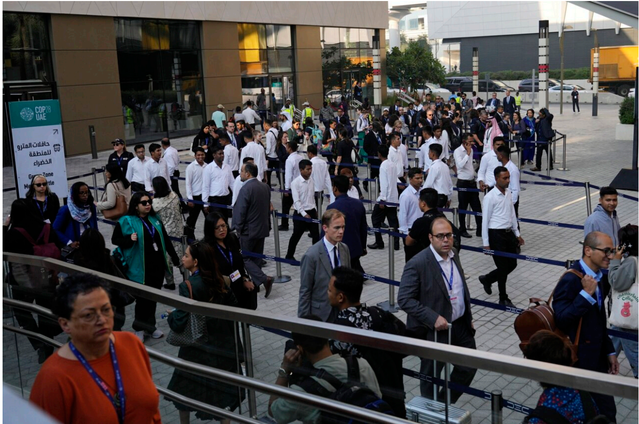
Delegates arrive for the day at the COP28 U.N. Climate Summit, Sunday, Dec. 3, 2023, in Dubai, United Arab Emirates.

The Dubai government, on its web site , listed its Air Quality Index level mostly at "good" on Sunday.